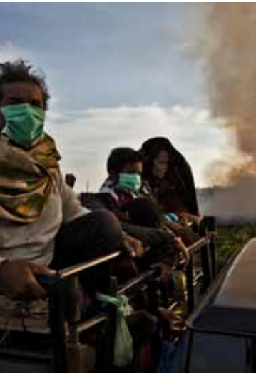
June 2013, Riau Villagers wearing protective face masks drive through smoke rising from fires on recently cleared peatland in an oil palm plantation.