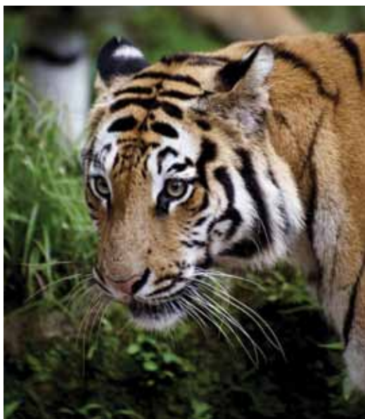
March 2013: Sumatran tiger Deforestation by the palm oil sector is destroying critical tiger habitat.

Some palm oil producers are showing leadership. Companies that have 'gone beyond the RSPO' and committed to policies to ensure forest protection include Golden Agri-Resources, 50 New Britain Palm Oil 51 and Agropalma, 52 whose 'no deforestation' commitments demonstrate that a responsible palm oil sector is possible. Meanwhile, some consumer companies are setting standards for truly responsible purchasing policies. For example, Nestlé has made a clear commitment to break the link between palm oil and deforestation in its own supply chain. However, it is important to monitor closely how these policies are implemented.